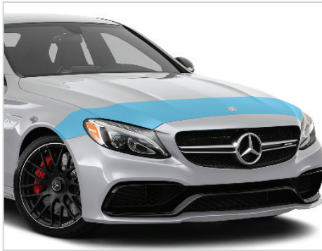
Partial Hood and Fender

Clear gloss polyurethane for stone chip protection, high wear, and abrasion in the automotive, motorcycle, RV, powersports, bicycle, aircraft, and other transportation markets.